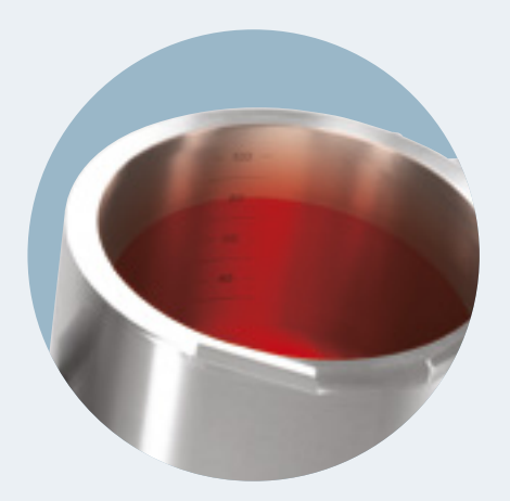
Unheated and insulated top