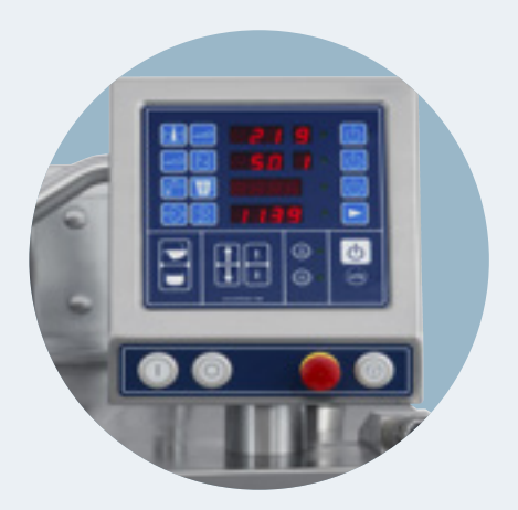
Adjustable control box