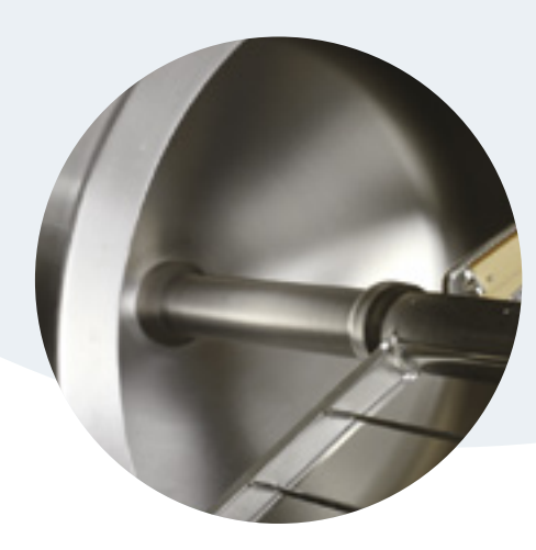
No unhygienic joins in the food area