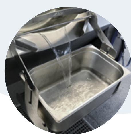
The Pouring Assist helps portioning in containers without splashing and heavy lifting.