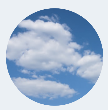
Environmentally friendly design