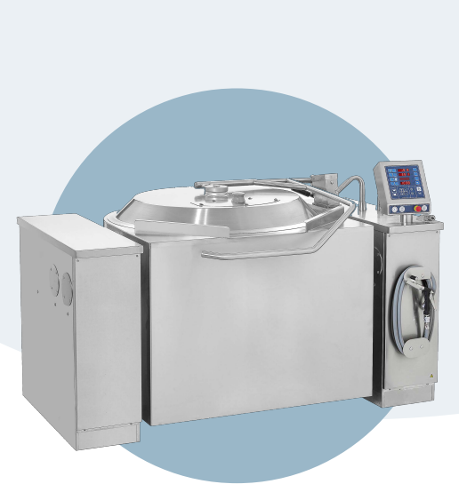
Compact and high performance for big volumes.