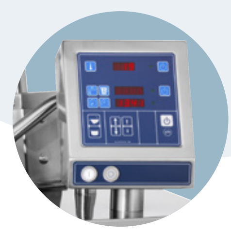
The control box can be turned in towards the kettle and is placed at a good working height.