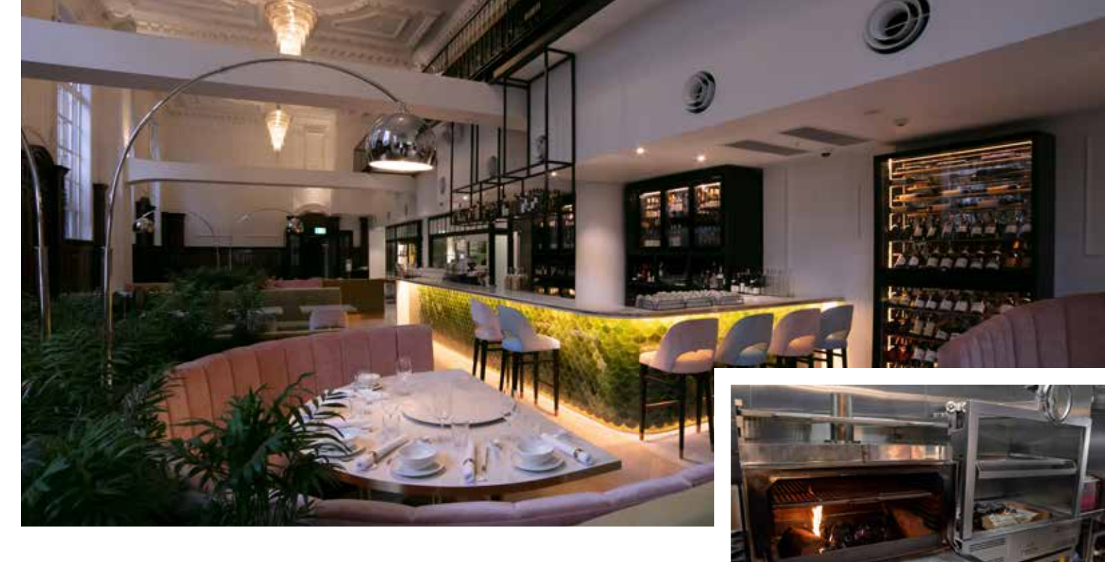
B oasting some of the biggest names in the Australian bar and restaurant scene, the Brisbane hospitality dynasty the Ghanem Group recently added its latest restaurant Donna Chang to its impressive list.

Situated in the heart of Brisbane's CBD in a heritage listed building which was once a bank, Donna Chang is now a hub for modern Chinese cuisine. The 120 capacity restaurant has 3 private dining rooms, hanging chandeliers and intricate ceiling carvings which serve as a reminder of its past life.