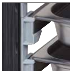
3 mm pan stops at each end of rails provide stability during transport.